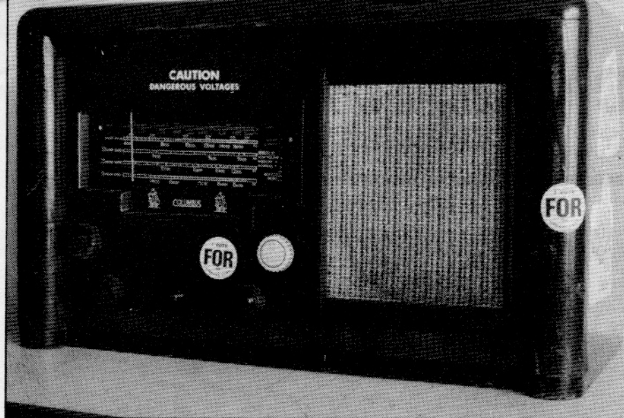
The author's Columbus 90 mantel model, before cabinet restoration. It dates from the 1940's. Note the scratched lacquer and stickers plastered over the cabinet.

the radio is working, I suggest that all paper and electrolytic capacitors as well as resistors should be checked with a meter. Replacements are inexpensive and any suspicious characters should be renewed.