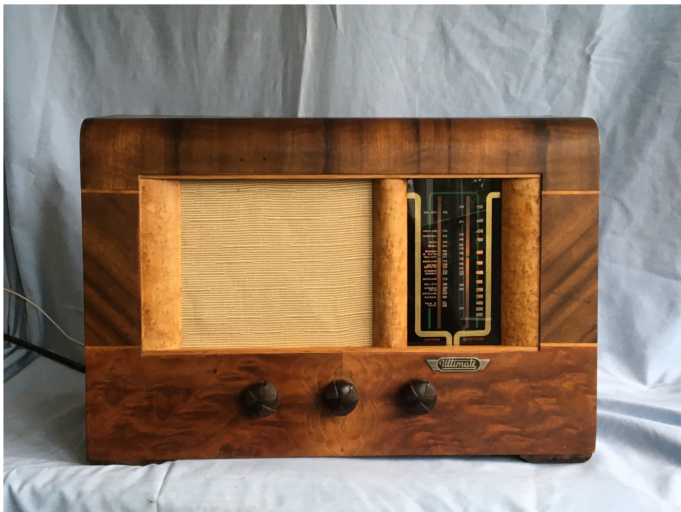
Ultimate model RB sn 94511.